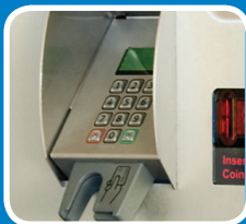
Integrated chip and pin key pad for credit and debit card