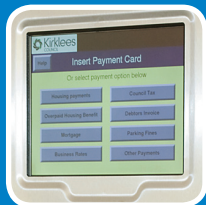
Customised touch screen display