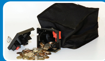
Self-locking coin bags and banknote cassettes ensure maximum security